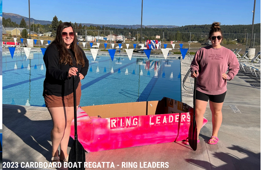
2023 CARDBOARD BOAT REGATTA - RING LEADERS