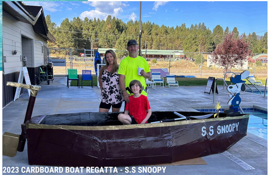
2023 CARDBOARD BOAT REGATTA - S.S SNOOPY