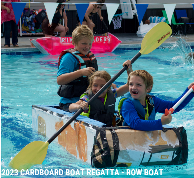
2023 CARDBOARD BOAT REGATTA - ROW BOAT